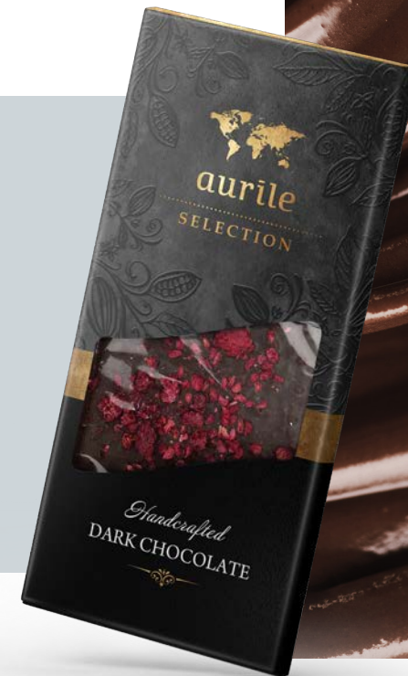
Raspberry Bites with freeze-dried raspberries