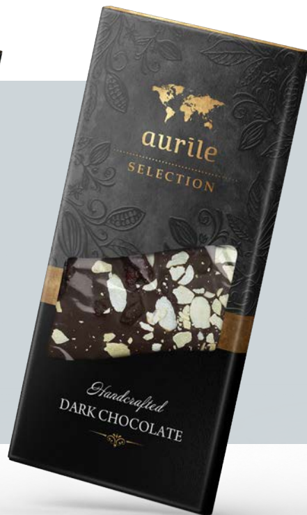
Cranberry Crunch with sweetened cranberries and almond flakes