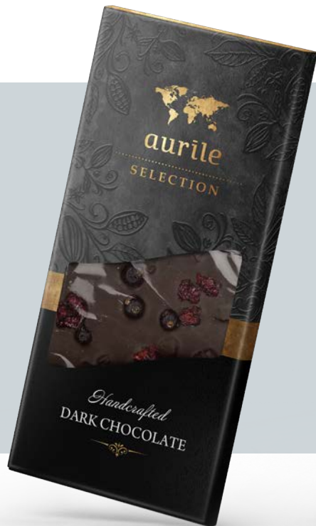
Cherry Currant Fusion with sweetened cranberries, freeze-dried cherries, and currants