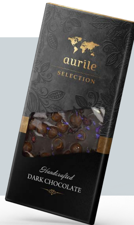
Nutty Berry Blossom with whole hazelnuts, sweetened cranberries, and cornflower blossoms